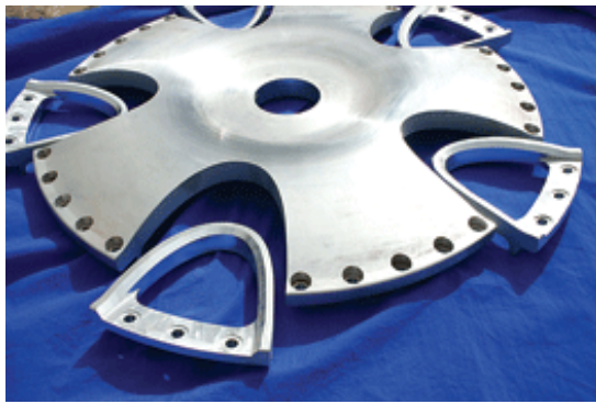
Abrasive Waterjet & CNC is pushing waterjet technology into areas previously reserved for more traditional precision machine tools.

current milling package, Esprit from DP Technologies as a test-bed and platform for post processor development. The key to success is to allow the programmer to utilize the easy to use milling package and to subsequently post the appropriate (NC) machine code for the waterjet 3D process.